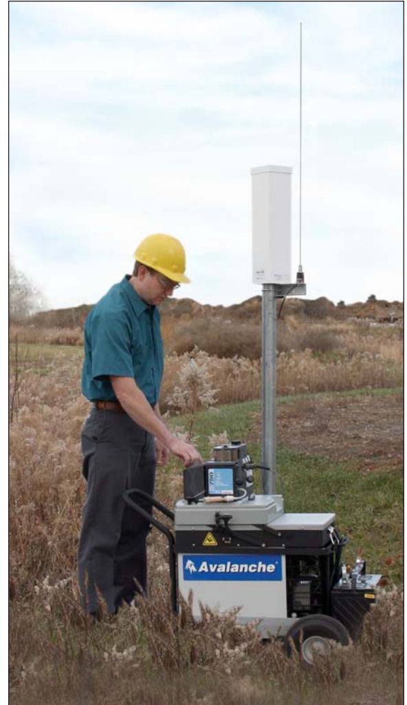
The compact satellite communicator is powered by an Isco 6712 or Avalanche® Sampler.